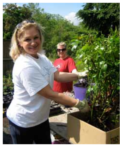
A volunteer pots up plants for NPA.

As you divide and propagate in your garden this fall, remember the specialty table and pot up one or more of your treasures to donate to the sale. It's an easy and effective way to volunteer for the NPA. I know what I'm selecting--watch for my Achillea grandiflora, a spectacular seven-