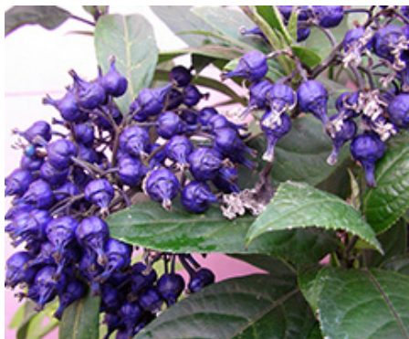
Top: Arisaema candidissimum and bottom, the blue berries of Dichroa fibrifuga , just two of the many unusual plants coming to the NPA Spring Plant Sale.